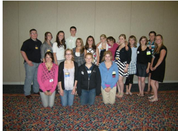
NHQHYA with representatives from Vermont, Connecticut and Massachusetts